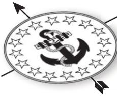
CHART YOUR COURSE WITH Maritime Institute

It is MARITIME INSTITUTE'S goal to provide a path that allows its students to obtain licensure and complete an Associate's and/or Bachelor's degree program that will enhance the individual's self-worth, education and provide upward mobility.