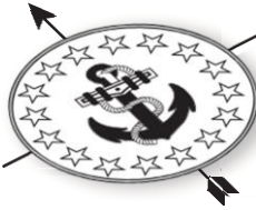
CHART YOUR COURSE WITH Maritime Institute

It is MARITIME INSTITUTE'S goal to provide a path that allows its students to obtain licensure and complete an Associate's and/or Bachelor's degree program that will enhance the individual's self-worth, education and provide upward mobility.