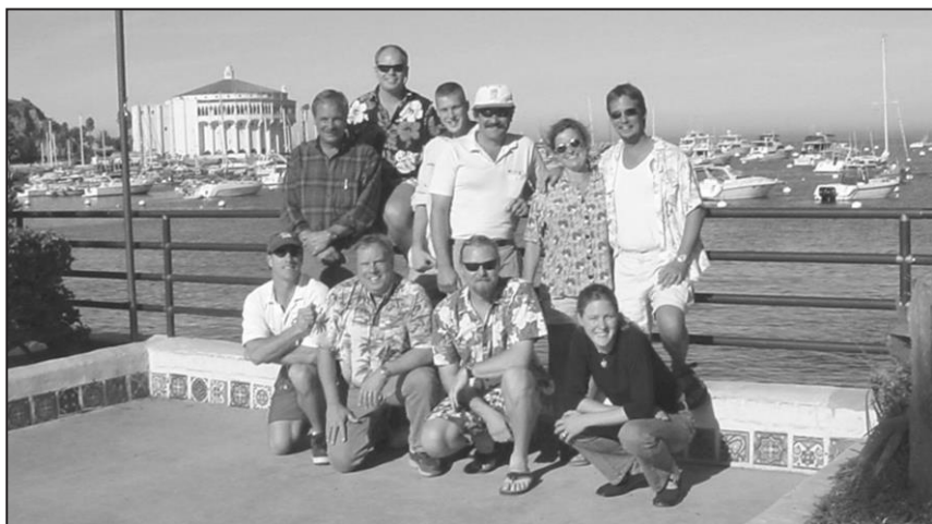
An "Away Class" held on Catalina Island, California